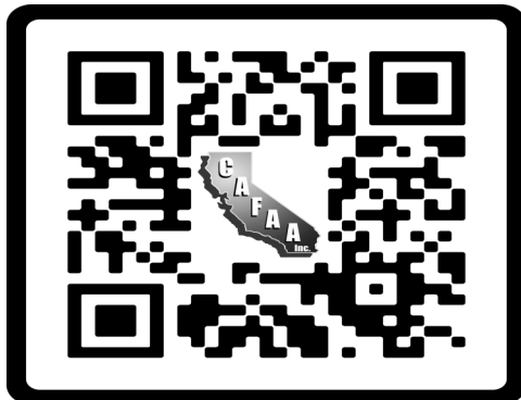
CAFAA Conf. Registration

California Automatic Fire Alarm Association